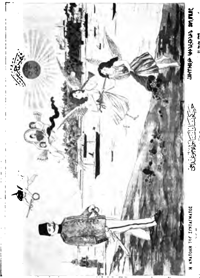
A POPULAR CARTOON, APRIL 1909 (Ever Fey and the Dawn of Liberty)